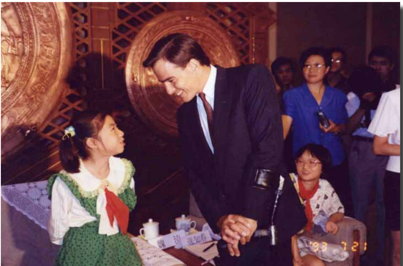
above: Award ceremony at the Great Hall of the People in Beijing for China's talented disabled artists.

Planned, project managed and executed all company public relations programs for KFC, Pizza Hut and PepsiCo Restaurants International (PRI) in Asia. Responsibilities included: developing brand building PR strategies to expand company reputation as a caring corporate citizen and model employer, developing media relations, managing large scale events and conferences, producing corporate collateral and videos and managing customer relations. Managed PRI's support of 'China's Talented Disabled Artists' initiative as well as PRI Singapore's participation in The National Council of Social Services Disability Campaign, culminating in the company winning the 1996 Model Employer Award.