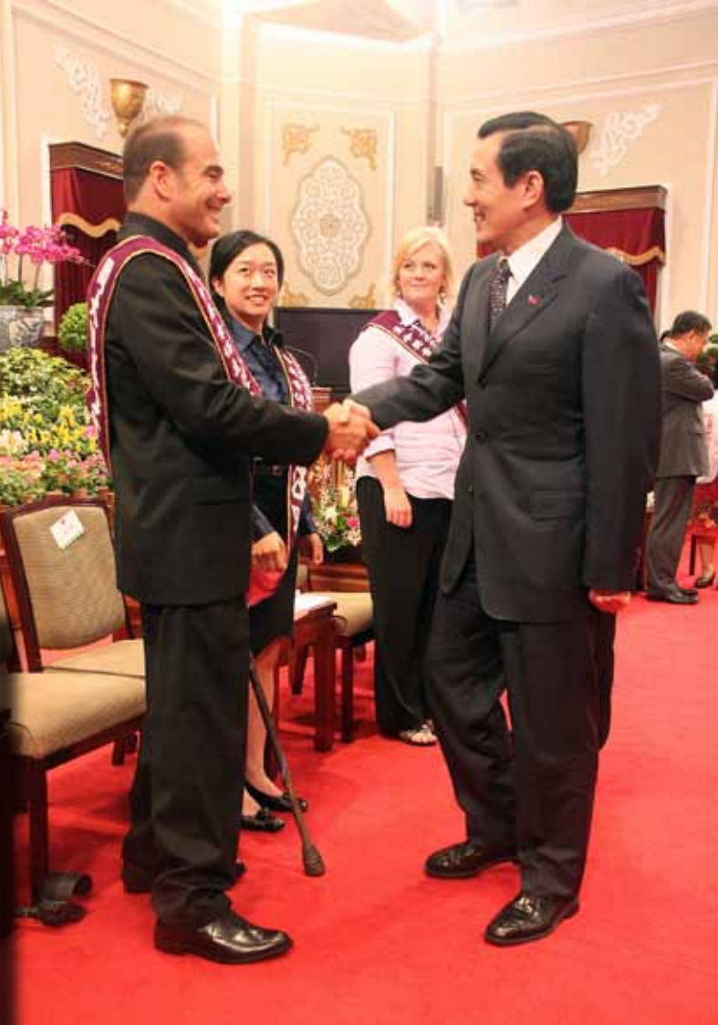
above: Reception for the recipients with President Ma at Taiwan's Presidential Palace.