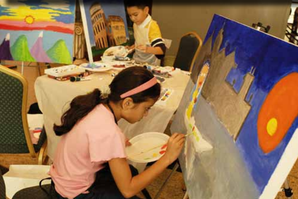
above: 'Journeys' art program for children, Singapore and Sydney.

2004- Credit Suisse Community Initiative 'Journeys' with VSA Singapore: Art Program Director