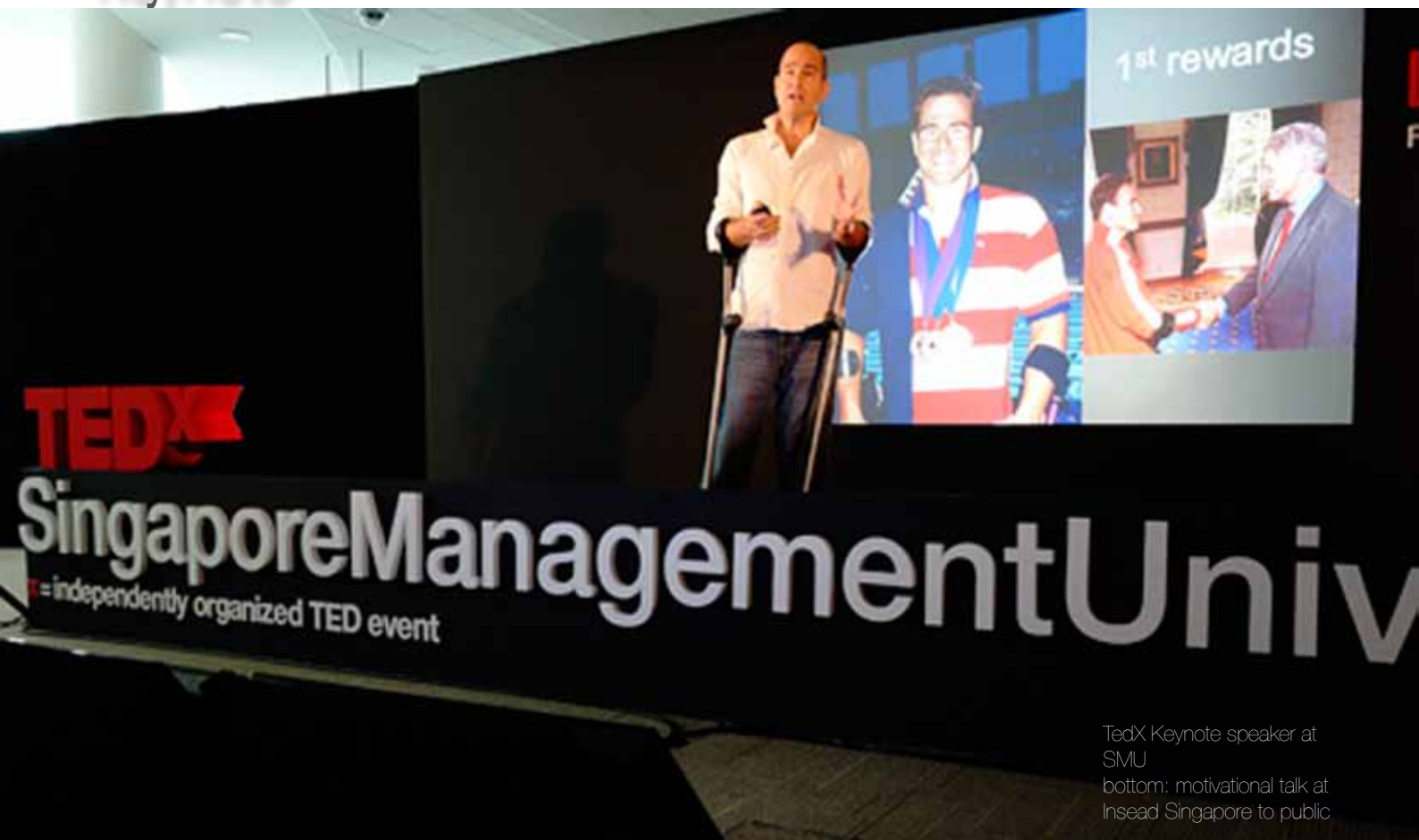
TedX Keynote speaker at SMU bottom: motivational talk at Insead Singapore to public