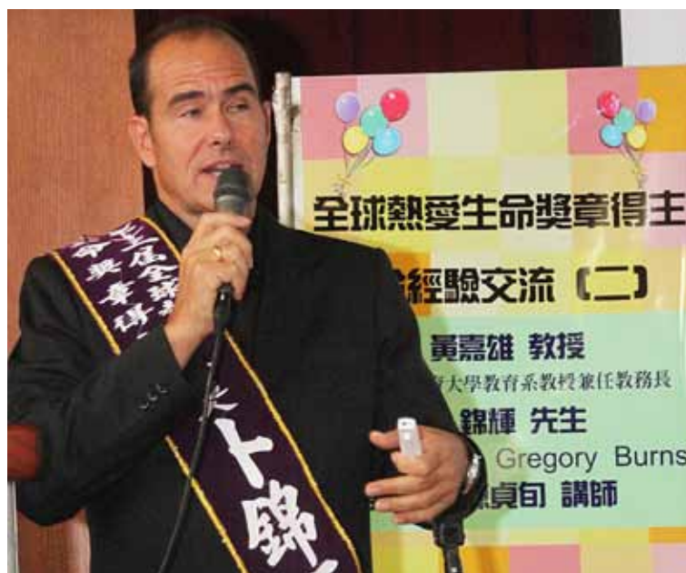
above: Speaking to schools throughout Taiwan with other achievers for the Chou Da Kuan Foundation.