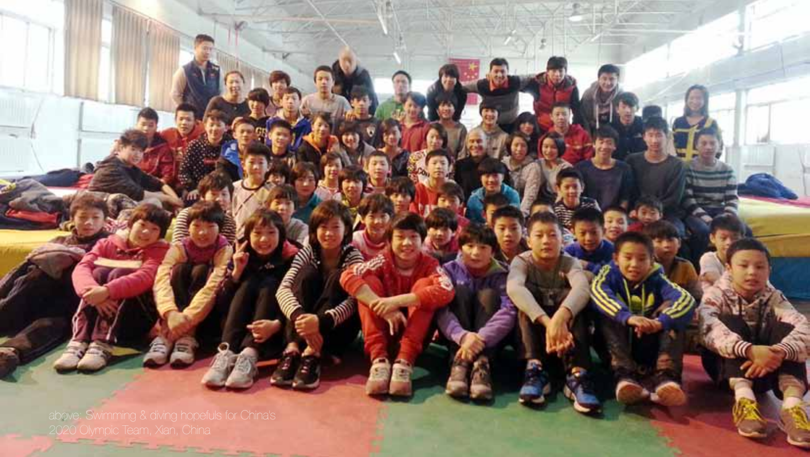
above: Swimming & diving hopefuls for China's 2020 Olympic Team, Xian, China