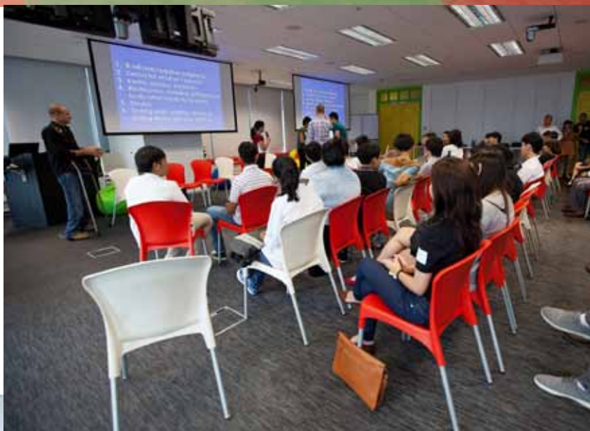
right & bottom: Mentorship program at Google, Singapore

Presented motivational talk to ITE students as part of an ongoing mentorship program spearheaded by the US Embassy in Singapore.